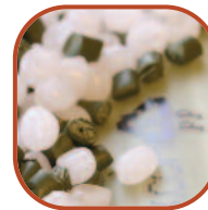
Made from environmentally acceptable polypropylene

Tubex Limited, Aberaman Park Aberdare, CF44 6DA, South Wales, UK T+44 (0)1685 888 000 F+44 (0)1685 888 001 plantcare@tubex.com www.tubex.com